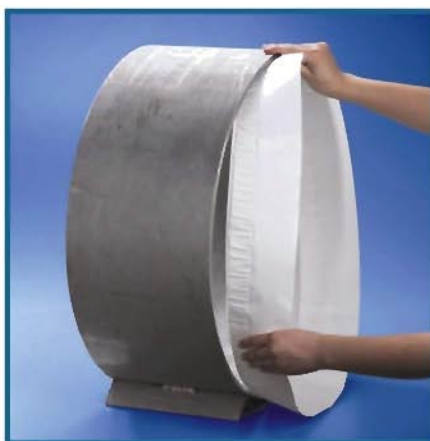
Fig. 6. EZ-P 24 insert.

"Time and cost are two of the most important contractual aspects of any construc-