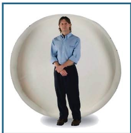
Fig. 5. Man inside 72 inch EZ Purge.

"EZ Purge" uses a portion of the amount of noble gas compared with other purging technologies and delivers the highest quality weld. Conventional purging methods such as inflatable rubber bladders, rubber gaskets and cardboard discs can only be used on one joint at a time, then removed. Filling the line with argon is time consuming and creates idle labour. Further, positioning and removing purge bladders can be troublesome as well prolong set up and tear down, all costly and time consuming activities. All these factors can severely impact the timeline of the project and critical path.