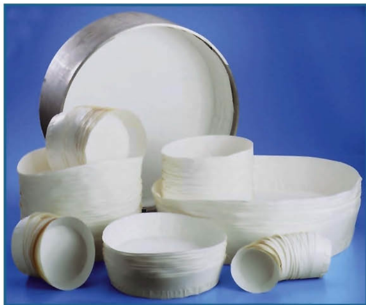
Fig. 1. EZ Purge HR EZP Group.

The Pearl GTL (gas-to-liquids) Project in Ras Laffan/Qatar is the largest energy project ever launched in the State of Qatar and now the largest GTL complex in the world. A joint effort of Qatar Petroleum and Royal Dutch Shell, this project has offshore upstream gas production facilities as well as an onshore GTL plant that will produce thousands of barrels per day of GTL products including cleaner-burning diesel and aviation fuel, oils for advanced lubricants, naphtha used to make plastics and paraffin for detergents.