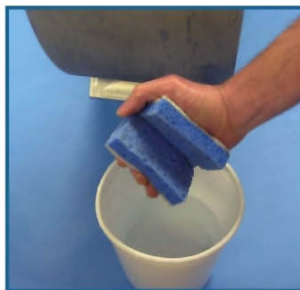
Fig. 3. EZ Purge HR EZP squeezing sponge.

tungsten electrodes, shielding gas and purging equipment. The stainless steel pipes alone for this particular project have been estimated to weigh 100,000 tons and include a variety schedules and diameters,