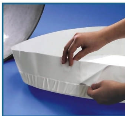
Fig. 2. EZ-P Peel.

These operations are time consuming, labour intensive and use excessive amounts of materials including welding wire, rod,